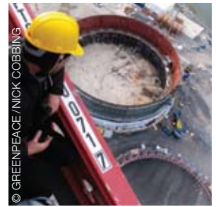
image Greenpeace activists occupy cranes above the Olkiluoto 3 EPR construction for one week. As of August 2008, the Finnish Nuclear Safety Authority (STUK) reported 2,100 safety and quality defects in the construction