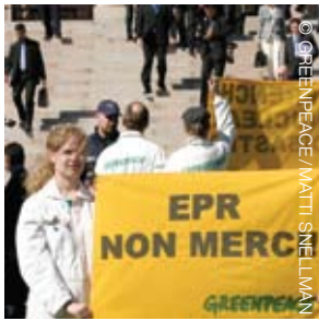
Image Greenpeace activists welcoming French Prime Minister Dominic De Villepin to Finland. Supplied by French Company Areva, Olkiluoto 3 is already 50% over budget