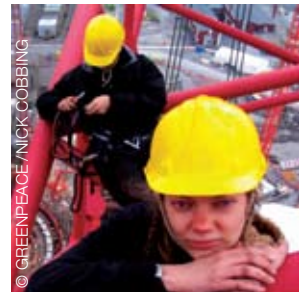
image Greenpeace activists scale 100 metre high crane in protest occupation at the construction site of Olkiluoto 3. With operation already postponed to 2012, Olkiluoto will not be ready in time to contribute to Finland's Kyoto target