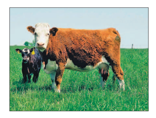
Cow and calf.

Anaerobic digesters are installed for various reasons—as a means to resolve environmental problems, as a means to economically re-use an otherwise wasted resource, and as a source of additional revenue. All of these factors typically play a role in an owner's decision to install a system.