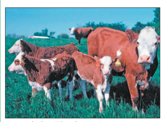
Cows and calves.