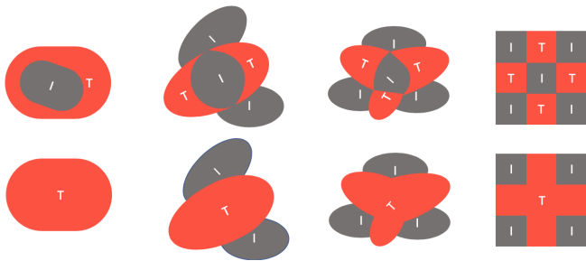
FIG. 3: RG rules in the 2D case. We show four cases where an insulating block is surrounded by 1,2,3,4 thermal blocks respectively. This is meant to demonstrate that any integer number of surrounding blocks is allowed.