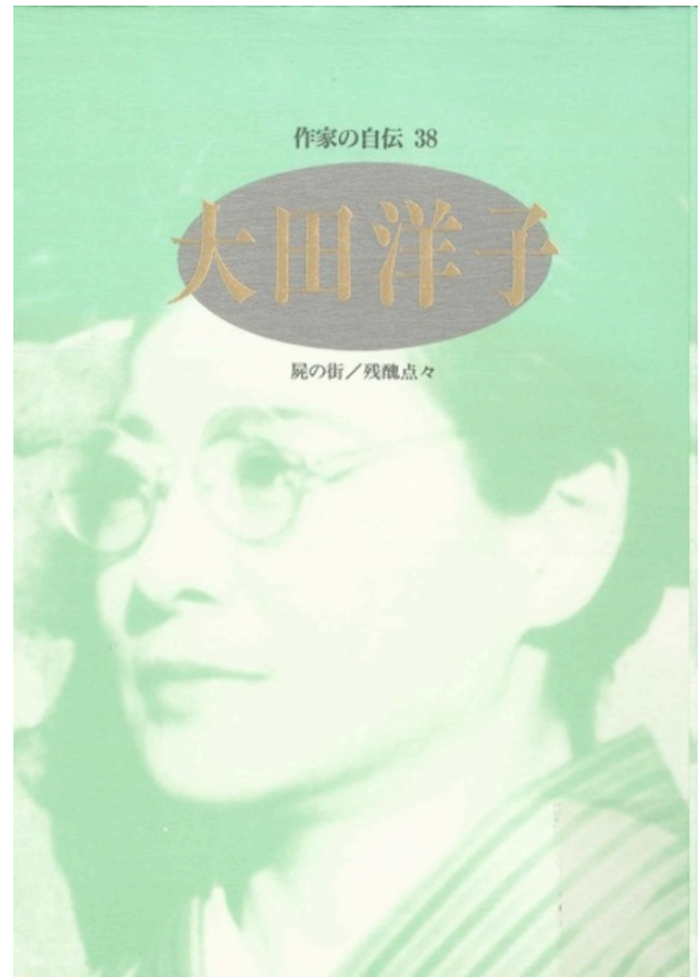
Illustrated book cover Ōta Yōko

Eventually there are non-witness authors who use Hiroshima as a historical background scenario or stage for their novels, such as Tsuji Hitonari's 辻仁成 (*1959) 2001 novel Taiyō machi 太陽待ち (Waiting for the sun). In Murakami Ryū's 村上龍 (*1952) SF-like Gofungo no sekai 五分後の世界 (The world five minutes after) of 1994, a world is delineated that could have been after Japan didn't surrender and the droppings of the bombs went on, until finally a big part of the population escapes the contaminated surface of the world and moves to the underground.