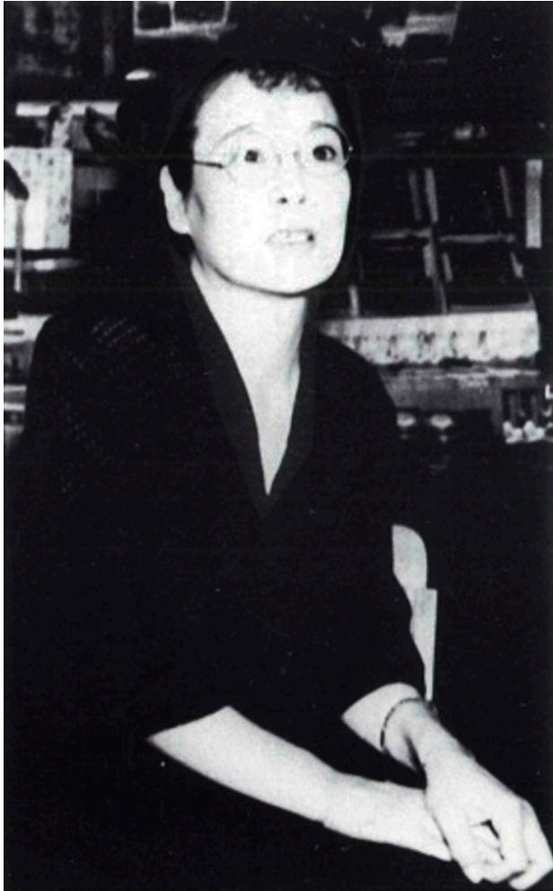
Ōta Yōko later photograph

These days one can observe a similar process when watching the consequences of the triple catastrophe of Fukushima. Life goes on, people start to forget, and the initial solidarity and engagement decrease, at the worst making way for the stigmatization of the victims, leading into a state of dissociation. The often-invoked Japanese stoic calmness in the face of catastrophes may be nothing other than a universal human reaction to trauma.