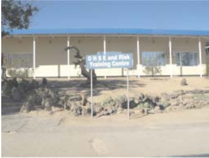
Rössing's OHSE and Risk Training Centre