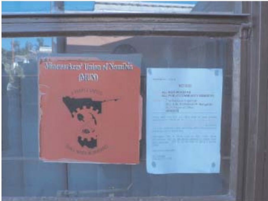
MUN office in Arandis

The Mine Workers Union of Namibia (MUN) is a recognized bargaining agent for mine workers in Namibia. The MUN is also the only sole bargaining agent on behalf of workers at Rössing.