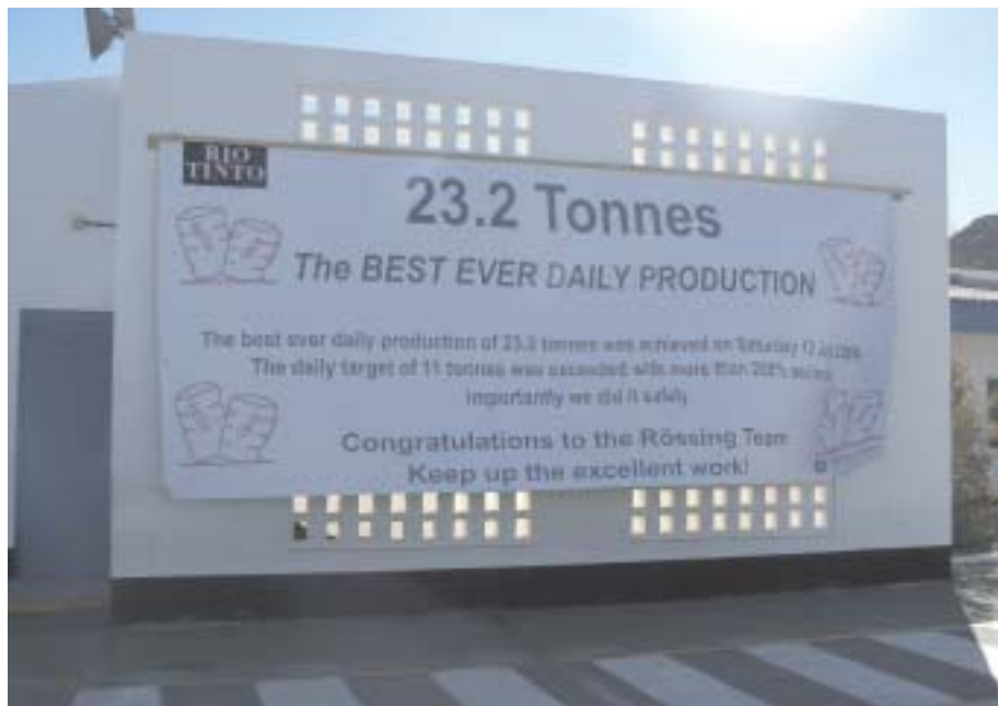
Highest daily production achieved at Rössing

The increased diversification of Namibia's mining sector away from diamonds is a very healthy development for the future of our country (New Era, 24 April, 2007).