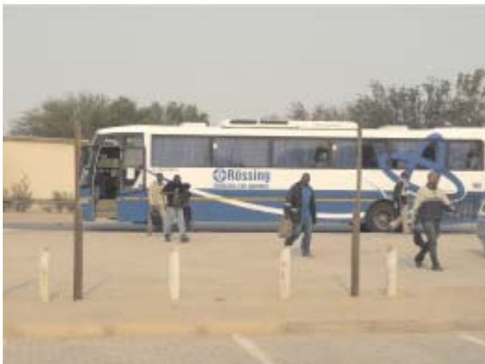
Rössing workers getting off the company bus in Arandis

Rössing has a lucrative package and who can say no to that. I was actually asked by my foreman to come back and train others and I came back because other offers could not match Rössing (current worker).