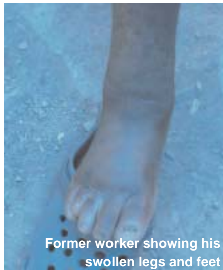
Former worker showing his swollen legs and feet

Meanwhile, the manager of external affairs at Rössing maintained that the annual health checks conducted by the company were credible. Through the health checks, the company claims to trace the health conditions of their workers and therefore 'the company cannot take responsibility if a person gets sick after leaving the employment of Rössing, because regular annual health checks are performed' . Workers nevertheless claimed that many times, their colleagues were laid off when the company knew their health had deteriorated.