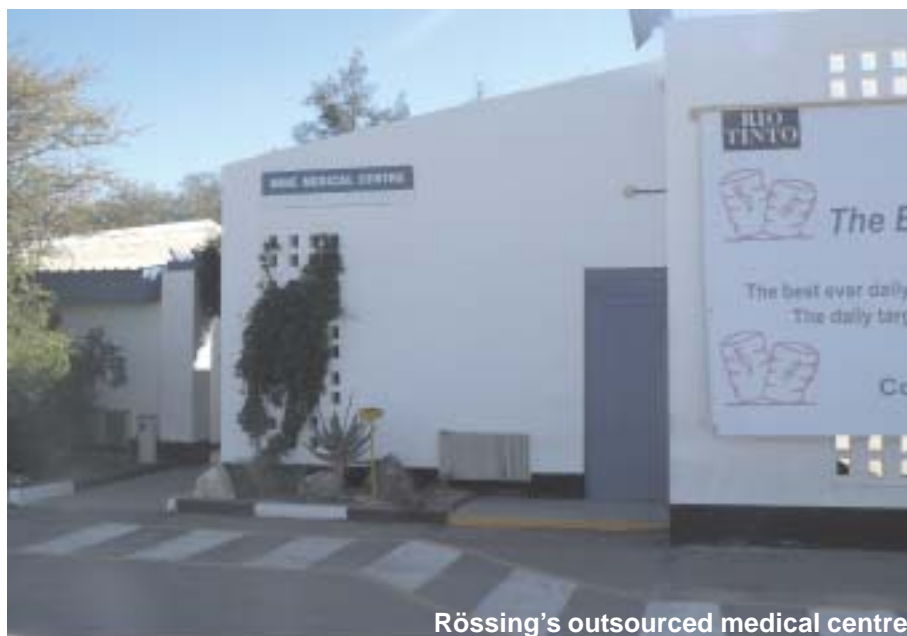
Rössing's outsourced medical centre

...I consult private doctors annually to keep track of my health status because I don't trust the mine doctor. ...It's only when workers have left Rössing; gone to private doctors that they are told the true reflection of their health status in terms of illnesses which means the mine doctor is gambling with the health of the workers and manipulating their files (current worker).