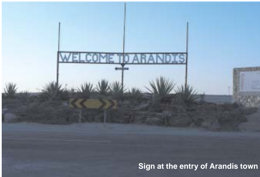
Sign at the entry of Arandis town

The town of Arandis was built by Rössing for its workers. After independence, the town was handed over to the Namibian government.