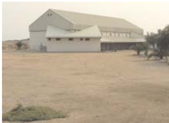
Part of NIMT

Rössing Uranium has made a significant contribution to skills development in Namibia. Rössing offered US$ 750 000 (N$6 million) to the Namibian government at independence to assist with the establishment of the Namibian Institute of Mining and Technology (NIMT) in Arandis.