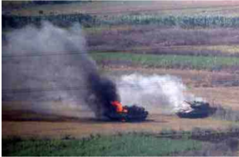
Fig.1. Israeli tanks burning after being hit by AT 5 anti-tank missiles.

Conflict, Israeli armor casualties were extraordinarily high due to the aggressive interception of Israeli radio communications, tactical alteration by adversaries, and the use of fourth generation anti-armor warheads on anti-tank missiles. These warheads are designed to penetrate the armor with multiple charges that explode to kill the vehicle crew members.