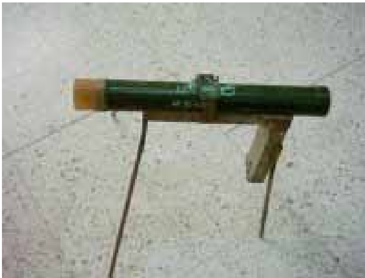
Fig.2. Anti-armor roadside improvised explosive device (IED)

Beside the new applications in IED, insurgents are deploying new kinds of armor penetration technology to defeat armored vehicles. The newest technology is the use of explosively formed projectiles (EFP) in IED's. EFP's are a relatively new type of shaped charge used against more lightly armored targets. While the penetration is generally less than a conventional shaped charge, the diameter of the hole created by these new generation charges is wider. Additionally, the caliber of the weapon necessary for initiation of the attack is smaller. Essentially, the conflict between armor protection and armor penetration that has been static since the introduction of ceramic armor thirty years ago, has become a race between protection and increasing penetration power. The implications for vulnerable shipments seem clear.(25,26,27,28,29)