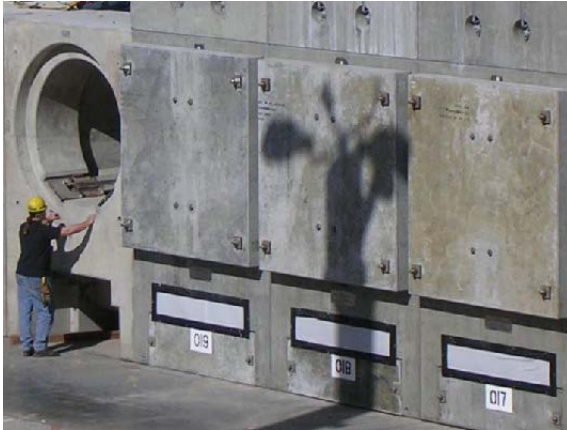
Horizontal storage system

The NRC developed cask licensing requirements through a public process to provide a sound basis for ensuring protection of public health and safety and the environment. NRC staff conducts thorough reviews and only approves designs that meet those requirements. Utilities can choose from two licensing options, which both allow for public input: