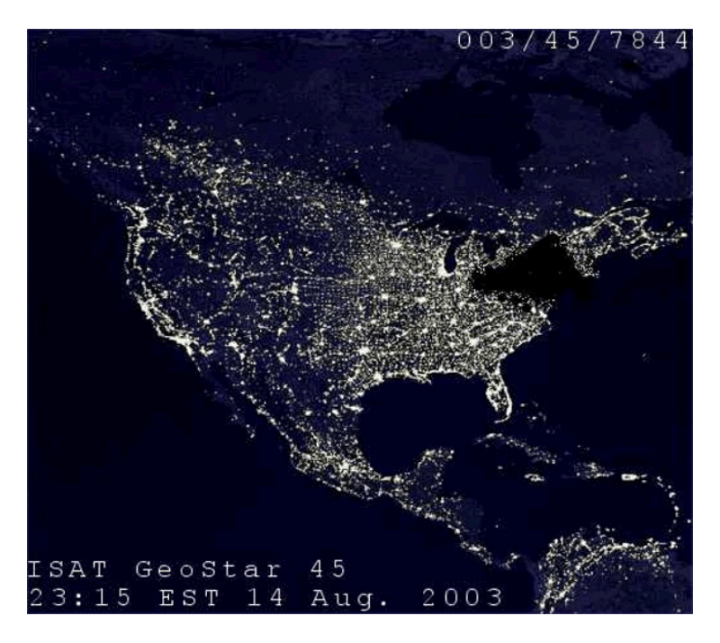
FIG. V-1. Blackout in the north-eastern USA and Ontario, Canada, August 2003 (not an actual satellite photo)

The North American blackout was in fact only one of seven blackouts in a six-week period in 2003 that affected more than 120 million people in eight countries: Canada, Denmark, Finland, Italy, Malaysia, Sweden, UK and USA. In Sweden, in September, a nuclear power plant tripped (i.e. rapidly shut down), resulting in the loss of 1200 MW(e) to the grid. Five minutes later a grid failure caused the shutdown of two units at another nuclear power plant with the loss of a further 1800 MW(e). To respond to this loss of 3000 MW(e) (about 20% of Sweden's electricity consumption) the grid operators isolated the southern Sweden–eastern Denmark section of the grid, but the voltage eventually collapsed due to the insufficient power supply. At the time of the original reactor trip two high-voltage transmission lines and three links to neighbouring countries were out of service for normal maintenance work and four nuclear units were off-line for annual overhauls. Their unavailability severely limited the options of the grid operators.