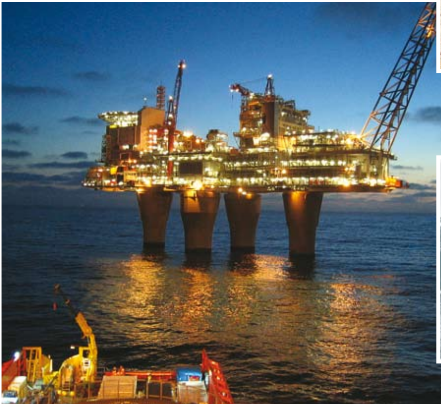
Cable laying in progress at the Troll A offshore gas platform in the North Sea.

In 1973 we produced and installed the world's first extruded polymeric insulated HVAC cable, - the 55 km long, 84 kV AC cable to the island of Åland in the Baltic Sea. No false of internal origin occurred during its service life. The high reliability of our cables together with very rigid health, safety and environmental regulations, where some of the reasons why we were chosen to deliver submarine power cables to some of the most demanding offshore oil companies in the world, such as Saudi Aramco in Saudi Arabia and Statoil in Norway.