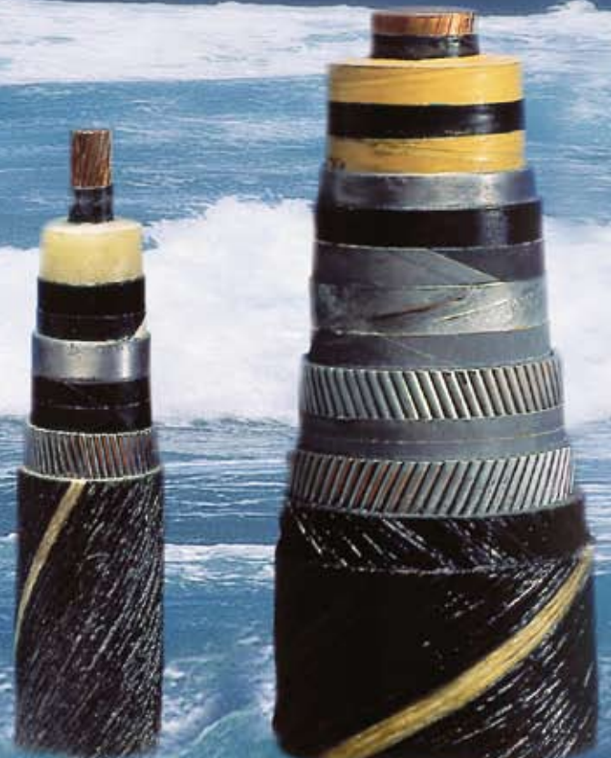
1 Polymeric HVDC Light cable for DC