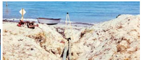
The world's first submarine XLPE cable connecting the Swedish mainland to the Finnish island of Åland. The cable link consists of three cables, 55 km each, for 84 kV. Laid in 1973.