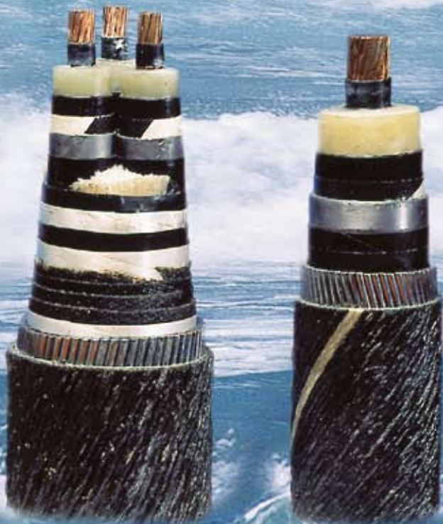
3 XLPE-insulated three-core cable for AC 4 XLPE-insulated cable for AC

Each cable type is being continuously developed in order to meet the market's demand for increased voltage and power capacity. Better materials and improved production and installation techniques have resulted in many world firsts and world records over the years.