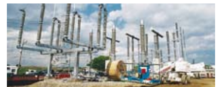
ABB can supply the entire transmission system.

the project, from the equipment specification, purchasing of raw material, manufacturing, laying and installation operations, to taking over. It also minimizes the final commissioning time and ensures optimum performance of the cable system with the highest possible availability.