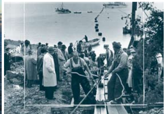
The world's first and longest (100 km) HVDC cable for 100 kV, 20 MW, connecting the island of Gotland to the Swedish mainland in 1953.